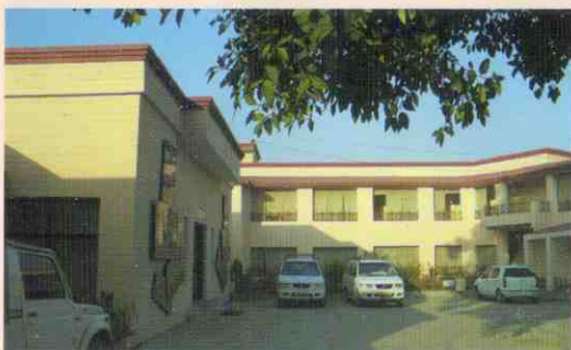
M.P. Tourism's Tourist Bungalow