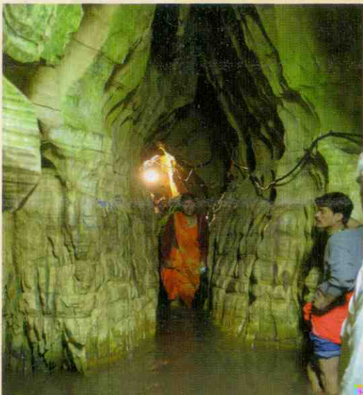
the faith of pilgrims

Ramghat : The ghats that line the banks of the river Mandakini reveal a constantly moving and changing kaleidoscope of religious activity. Here, amidst the chanting of hymns and the sweet fragrance of incense, holy men in saffron robes sit in silent meditation or offer the solace of their wisdom to