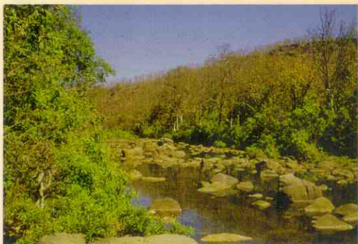
Calm and repose are all pervading at Chitrakoot

Gupt - Godavari : 18 km from the town by road is a natural wonder located some distance up the side of a hill. The wonder here is a pair of caves, one high and wide with an entrance