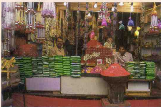
A profusion of colour : Chitrakoot's charming market place

through which one can barely pass, and the other, long and narrow with a stream of water running along its base. It is believed that Rama and his brother Lakshman held court in the latter cave, which has two natural, throne-like rocks.